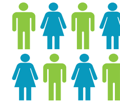
Population - Mackay, Isaac, Whitsunday