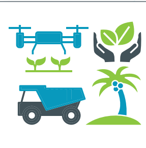
Economic Output - Mackay, Isaac, Whitsunday

RDA Greater Whitsundays work closely with local business, industry representatives and all levels of government to prepare for a sustainable and positive future for the region.